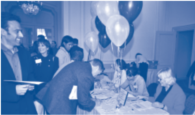
Ticket sales were brisk at the Donation Drawing table.