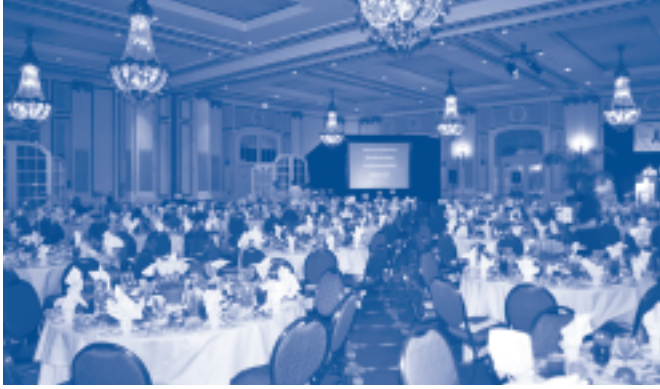
The quiet before the crowd at Palace Ballroom.